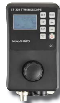
ST-329 Operation Control Enclosure