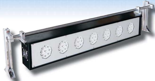
ST-329BL-4 LED Array shown with Optional Mounting Kit

The ST-329BL is designed for speed and frequency measurements in the printing, packaging, textile, automotive, cable, medical industries in various applications.