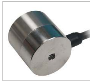
^ Female square drive

This rugged series of torque sensors is ideal for a wide range of torque testing applications in numerous industries. Square drives on both ends permit inline use with a torque wrench, or for use in OEM and other applications. Capacities available from 20 to 5,000 lbFin (2 to 550 Nm). Compatible with Mark-10 indicators (sold separately) through unique Plug & Test™ technology.