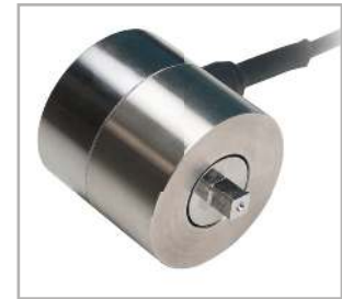
^ Male square drive