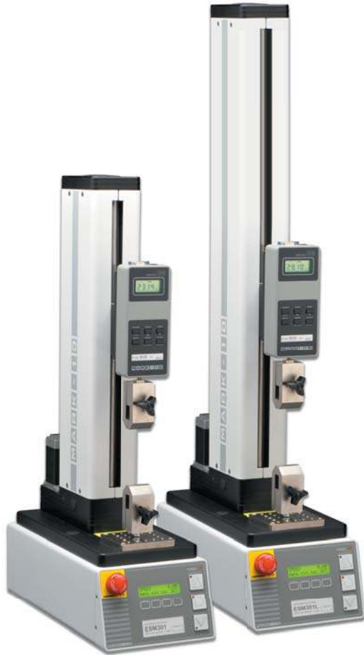
^ The ESM301 and ESM301L are shown in typical configurations with Series BG digital force gauges and G1008 film & paper grips

The ESM301 and the new ESM301L are highly configurable motorized test stands for tension and compression testing applications up to 300 lb (1.5 kN). The stands can be controlled from the front panel or via computer. The ESM301/ESM301L is engineered on a unique modular platform, allowing for “build-your-own” configurability. Features can be ordered individually at time of order or activated in the field. Integrated travel indication, overload protection, and a host of programmable parameters makes the ESM301/ESM301L quite sophisticated, while its intuitive menu structure allows for quick, simple setup and operation. A password can be programmed to prevent unauthorized changes. With a rugged and modular design, the test stand is a compelling solution for applications in laboratory and production environments.