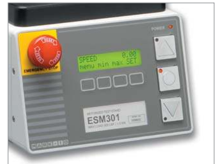
^ Digital controller contains a backlit LCD screen with menu choices for ease of setup and operation