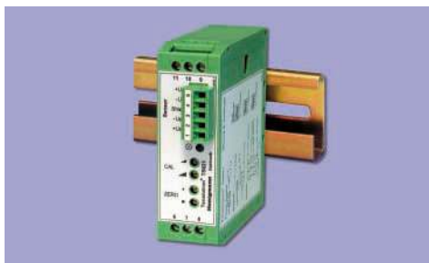
TS621 Strain Gauge Amplifier